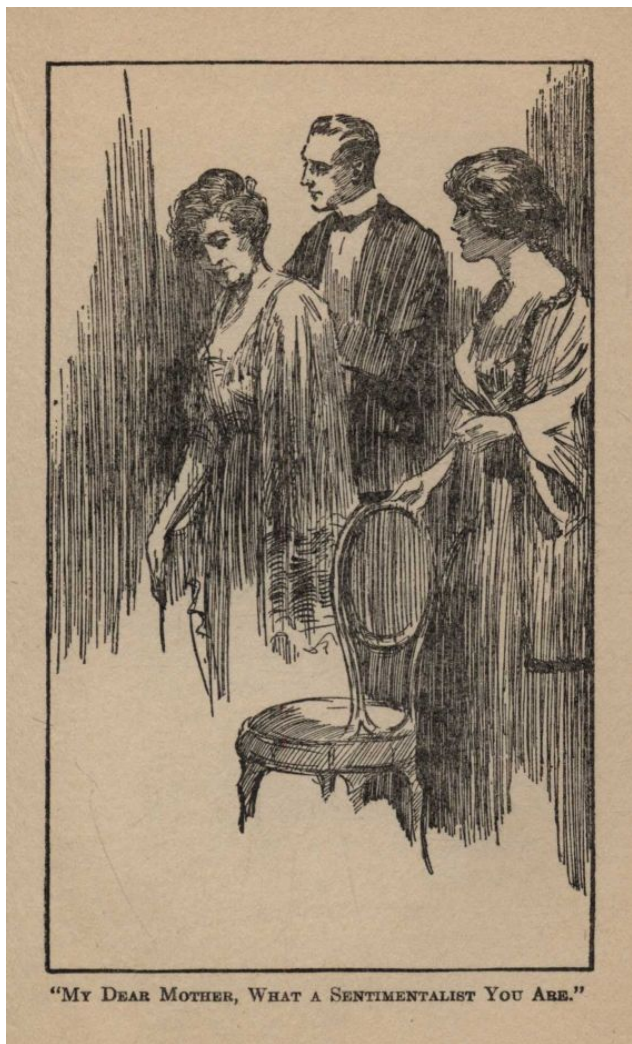
"MY DEAR MOTHER, WHAT A SENTIMENTALIST YOU ARE."

"My Dear Mother, What a Sentimentalist You Are."