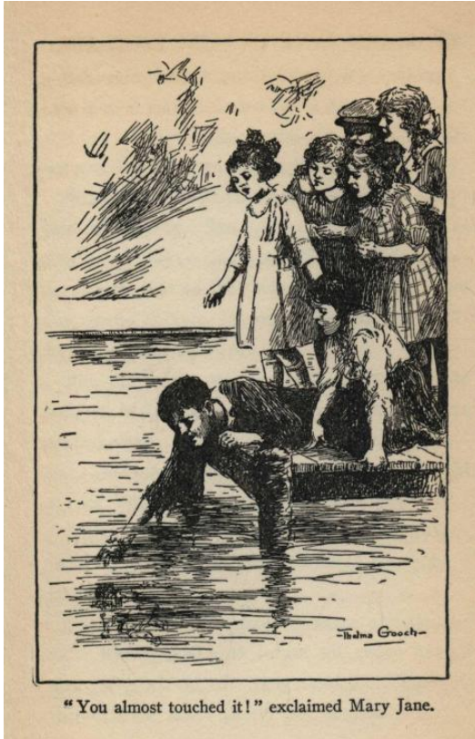
"You almost touched it!" exclaimed Mary Jane.

"You almost touched it!" exclaimed Mary Jane excitedly, "just reach a little more—"