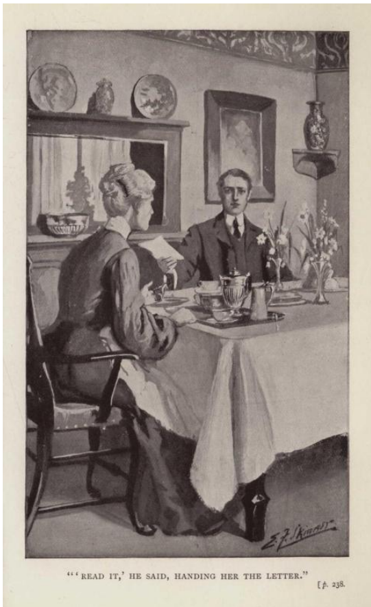
“‘READ IT,’ HE SAID, HANDING HER THE LETTER.” [p. 238]

”READ IT,’ HE SAID, HANDING HER THE LETTER.”