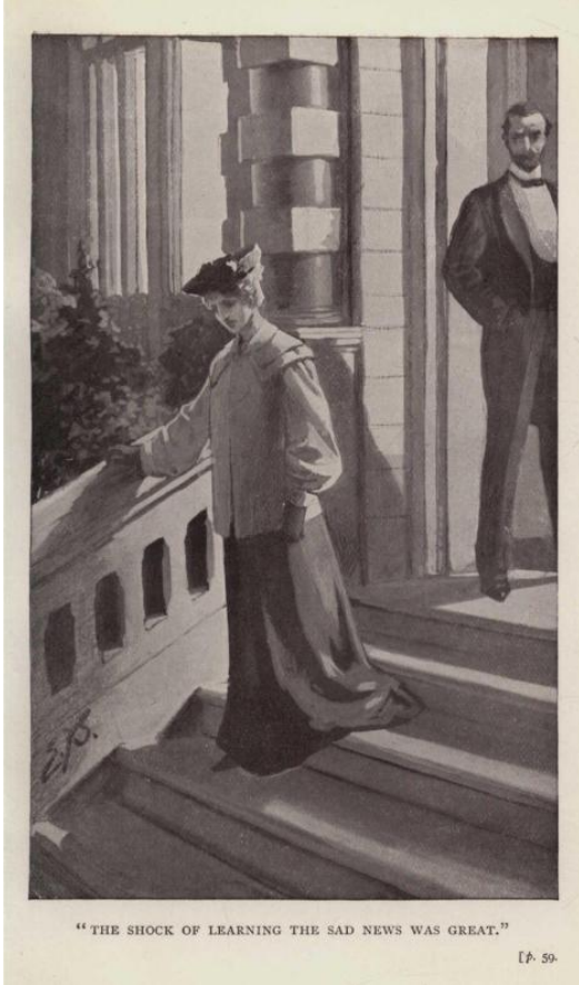
"THE SHOCK OF LEARNING THE SAD NEWS WAS GREAT."