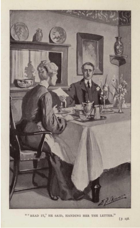
“‘READ IT,’ HE SAID, HANDING HER THE LETTER.” [p. 238]

”READ IT,’ HE SAID, HANDING HER THE LETTER.”