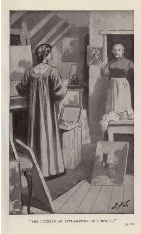
"SHE UTTERED AN EXCLAMATION OF SURPRISE."