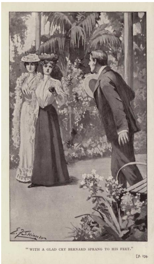
"WITH A GLAD CRY BERNARD SPRANG TO HIS FEET."