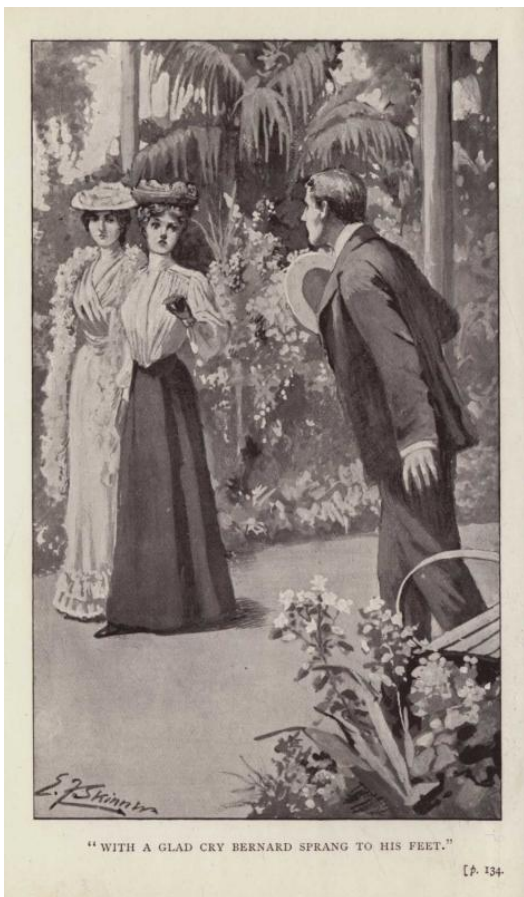
"WITH A GLAD CRY BERNARD SPRANG TO HIS FEET." (p. 134)