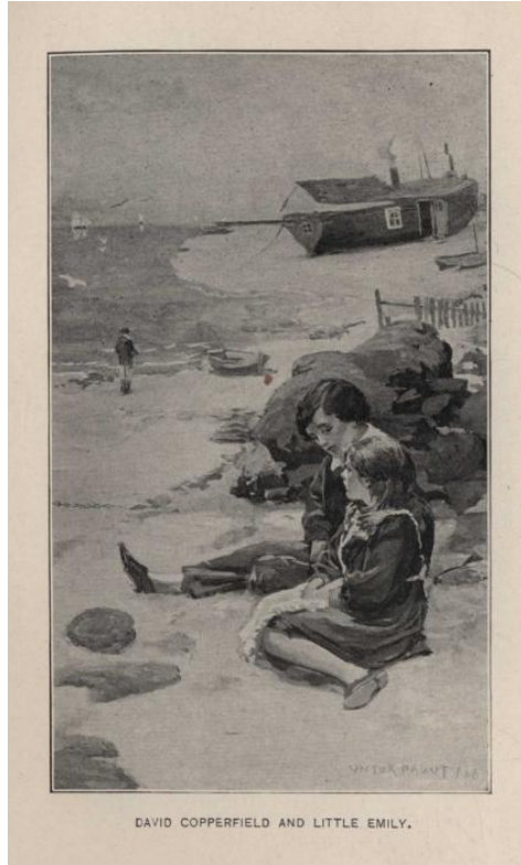
DAVID COPPERFIELD AND LITTLE EMILY.