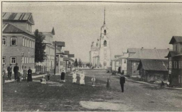
The church at Yemetskoye is visible for many miles up the Dvina.