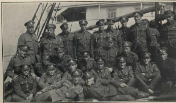
These Canadians fought in France before they went to Russia.

The "Y" was always on the job. These Canadians fought in France before they went to Russia.