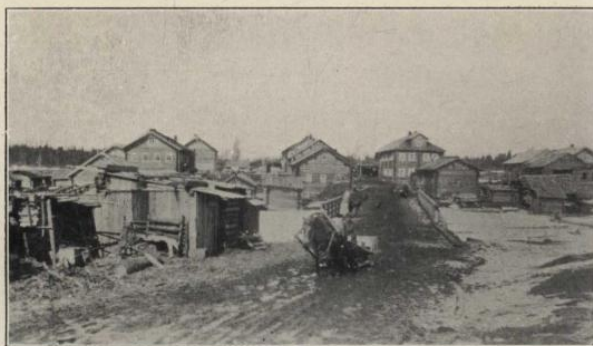
Russians love their homes and their villages devotedly.

The women work in the fields with the men. Russians love their homes and their villages devotedly.