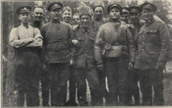
Canadian soldiers with two captives, having changed caps.