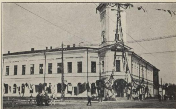
The Duma building at Archangel was decorated in honor of the new army that came to finish the Bolsheviki.

The new British army entered Archangel in June with great pomp and ceremony.