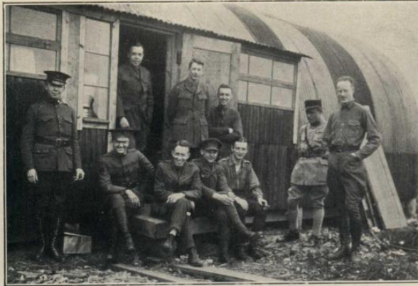
The "Y" was always on the job.