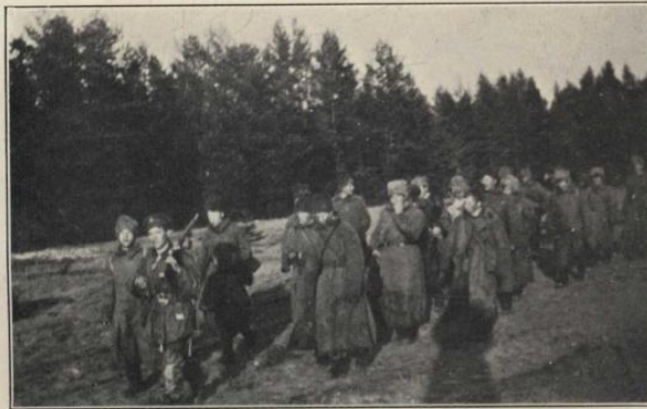
Bringing Bolsheviki prisoners into Malobereznik.

Canadian soldiers with two captives, having changed caps. Bringing Bolsheviki prisoners into Malobereznik.