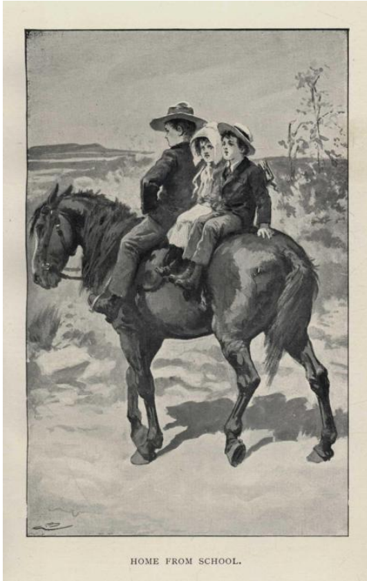
HOME FROM SCHOOL.