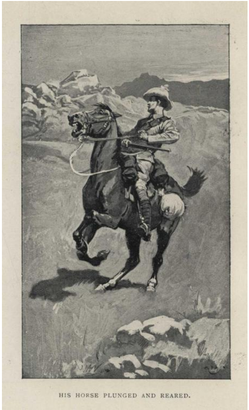
HIS HORSE PLUNGED AND REARED.

absurd, for no shrub was more than two or three feet high. He raised his revolver; his finger was at the trigger. Then he saw three small faces over the edge of one of the bushes—three that he knew; they were the stolid, secret-looking little boys who had lighted him to the stable last night.