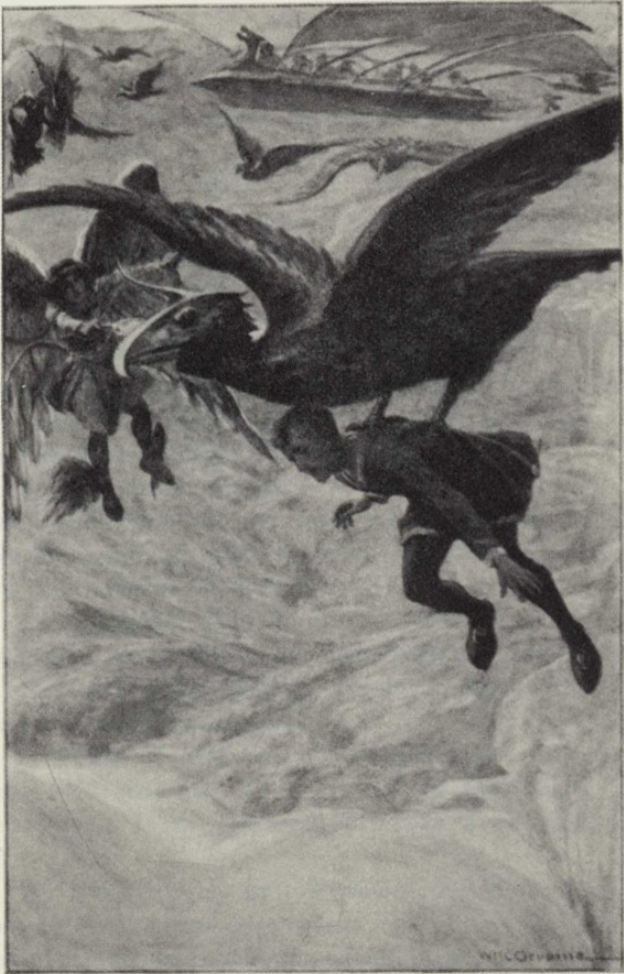
There was a flash of light, and a sharp, crackling sound. M. PAGE 124.

There was a flash of light, and a sharp, crackling sound.