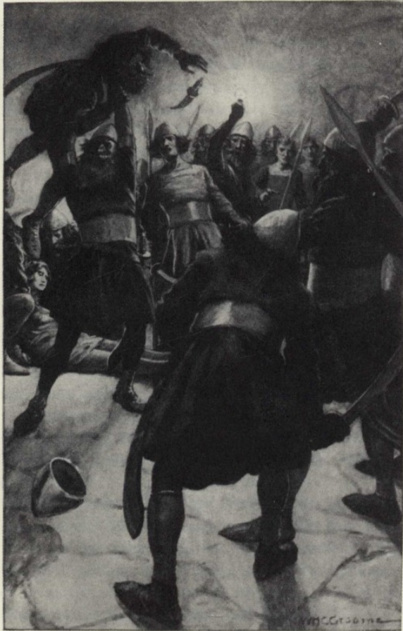
The assailant was lifted high in the air and flung down with terrible force.