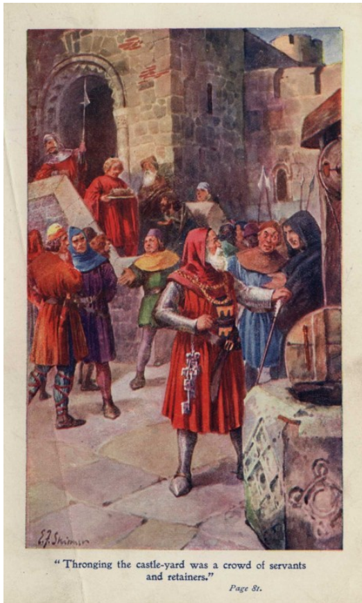
“Thronging the castle-yard was a crowd of servants and retainers.”