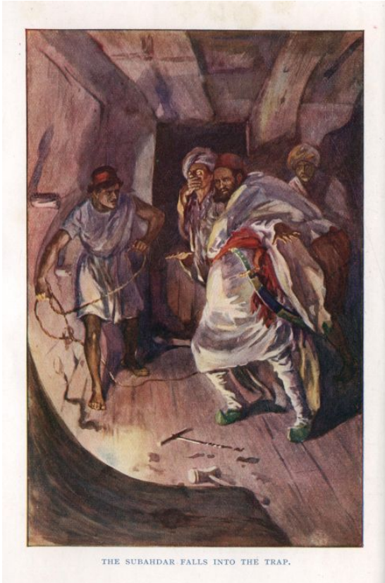
THE SUBAHDAR FALLS INTO THE TRAP.