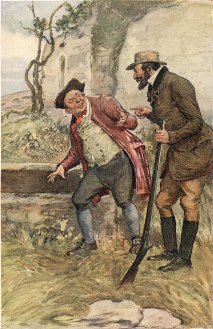
" THERE WAS NO ONE TO HEAR THE SHORT DIALOGUE THAT ENSUED AT THE HEAD OF THE WELL."

"THERE WAS NO ONE TO HEAR THE SHORT DIALOGUE THAT ENSUED AT THE HEAD OF THE WELL."