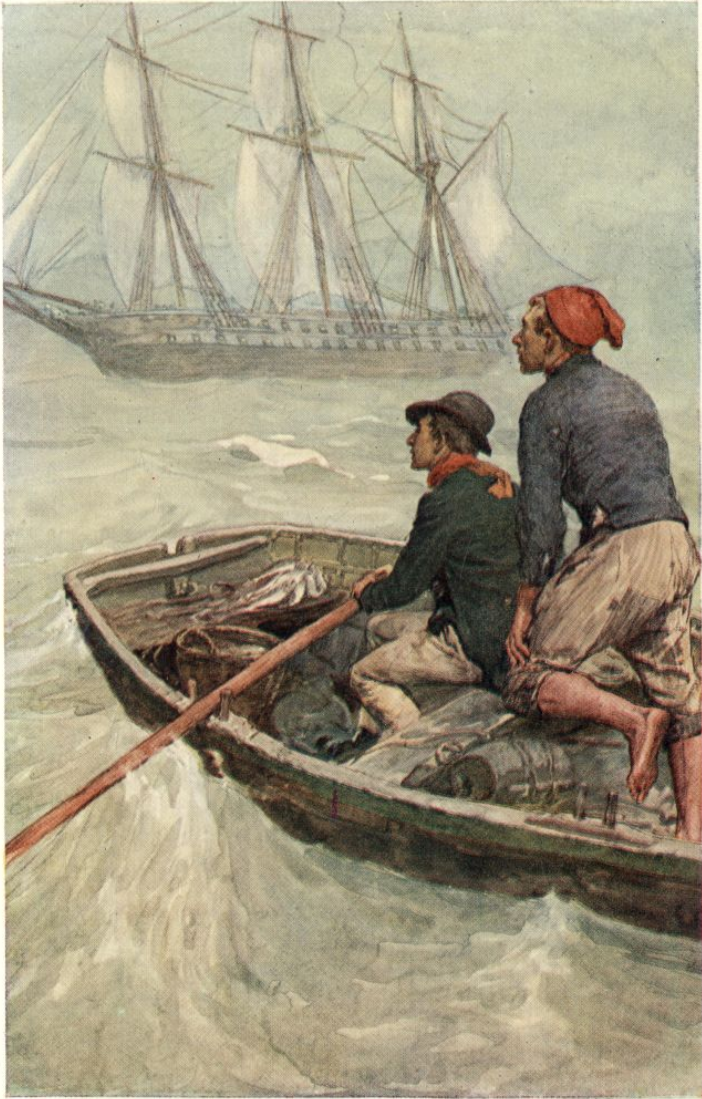
"THERE LOOMED OUT OF THE MIST A THREE-MASTED VESSEL."