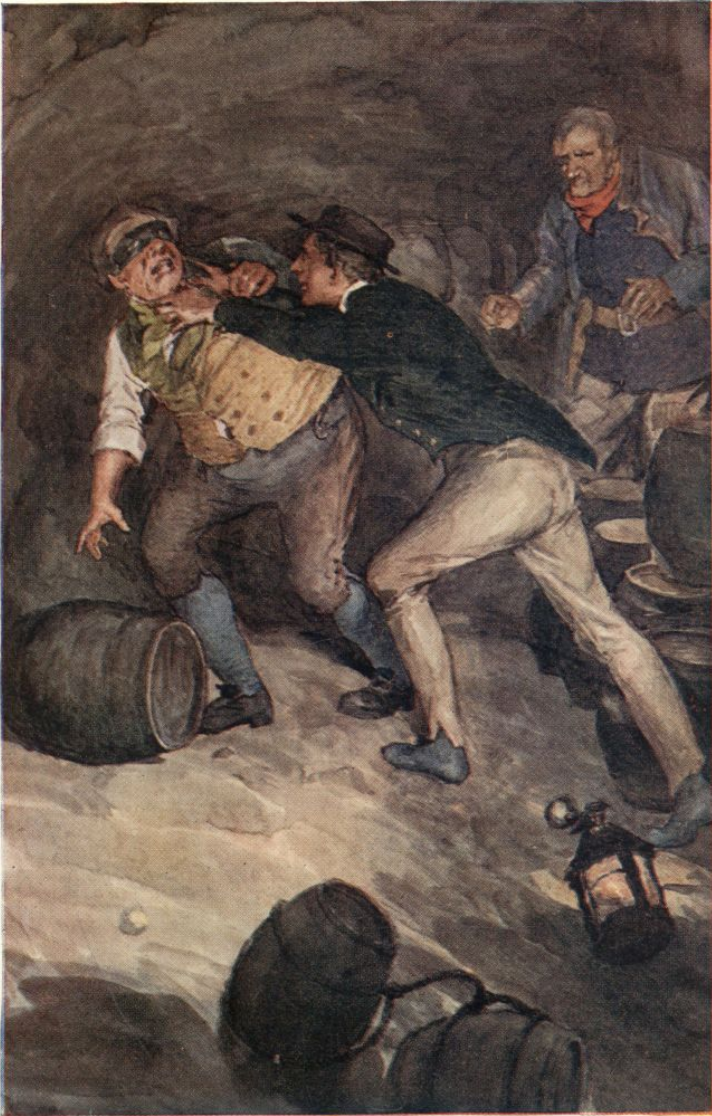
"DICK RUSHED LIKE A WHIRLWIND ON THE MAN."