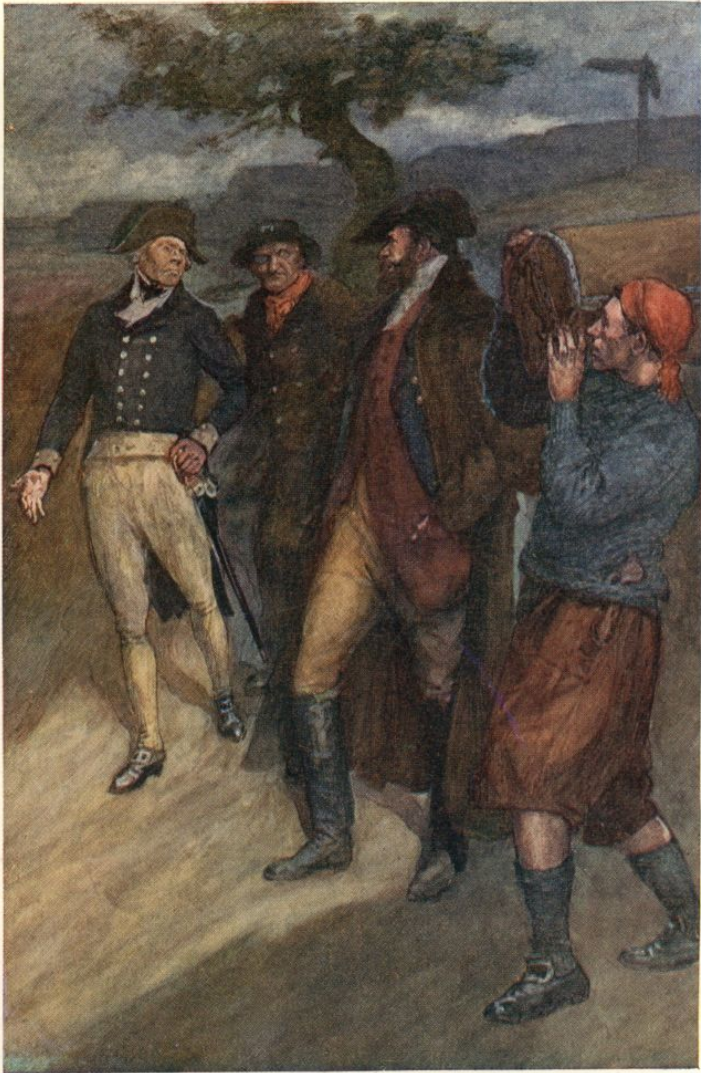
“HALT, IN THE KING’S NAME!” CRIED MR. MILDMAY

“HALT, IN THE KING’S NAME!” CRIED MR. MILDMAY”