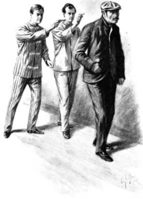
"The procession of three led by the stranger."

for before he could do either he was taken in the rear and found himself a target. There stood the Duke in his pajamas, with a handy little Smith and Wesson not a foot from the intruder's temples, and with his left hand significantly extended.